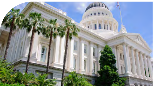
CALIFORNIA STATE CAPITOL

The California State Capitol is a short walk from Esquire Plaza. The architecture of the California State Capitol was modelled after the U.S. Capitol building in Washington, D.C. and was originally built between 1860 and 1874.