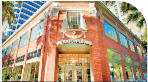
SEVERAL HOTELS NEARBY

In the Governmental Affairs District, Esquire Plaza is at the center of it all. Visitors and clients will only need to walk a few blocks to reach the Residence Inn by Marriott, Sheraton Grand, Hyatt Regency, and Citizen Hotel.